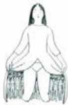
"Gift" 2016, 45 sec, loop animation