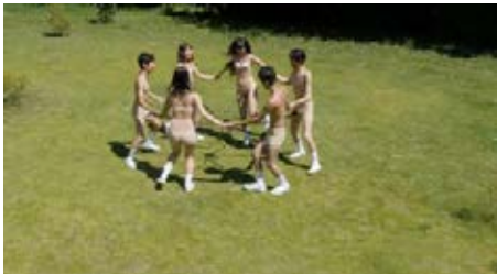
"Love" 2016, 55 sec, loop animation