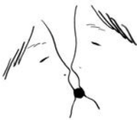
"Kiss" 2016, 35 sec, loop animation