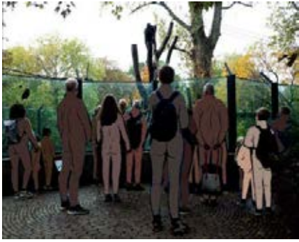
“Silent tango” 2021 , 12 min 14 sec